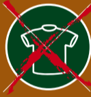
Clothing and shoes