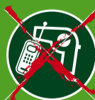
Small electrical appliances