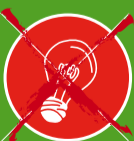
Lightbulbs and fluorescent tubes