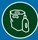
Plastic packaging material