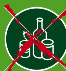
Glass and metal packaging material